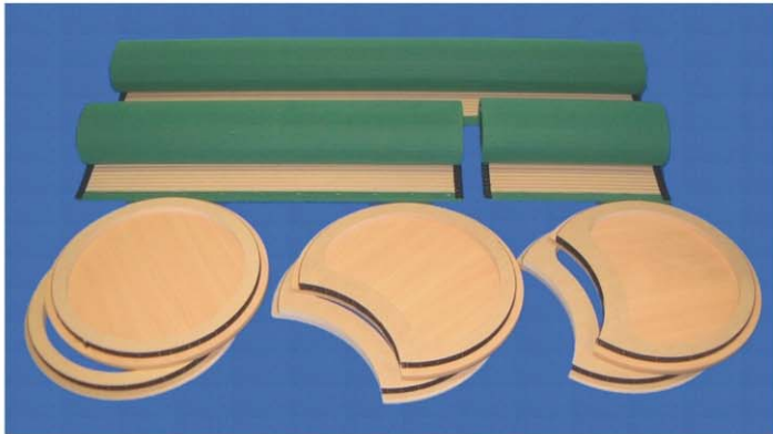
a typical kit includes : 3 tambour wraps, 3 tops and 3 bases