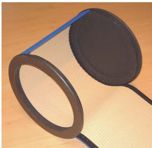
Fit the top to the wrap