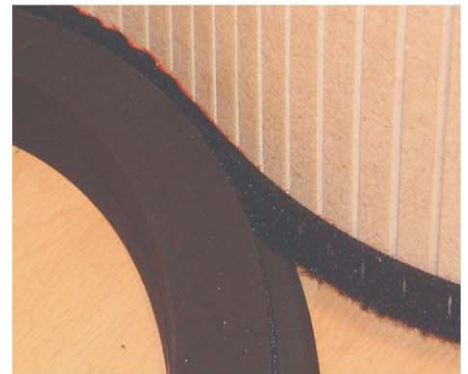
Ensure the hook fastener is fitted securely around the lip of the base and the top