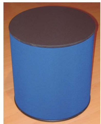
Finally fit the the remainder of the wrap to complete the unit

Assembled size : 400, 800 or 1200mm (H) x Diameter 400mm (depending upon version supplied)